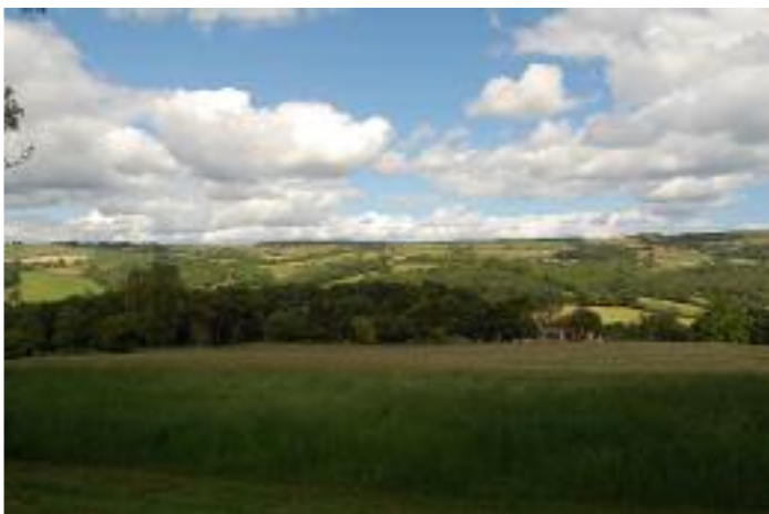
Looking north across the paddock towards Hollins Hall

Grosmont is a pretty and popular Moorland village famous for the steam railway which runs between Pickering and Grosmont. An important tourist destination, the opportunities for outdoor recreation in and around Grosmont and the North York Moors are endless. The sea-side town of Whitby lies only seven miles to the north and offers a wide array of amenities.